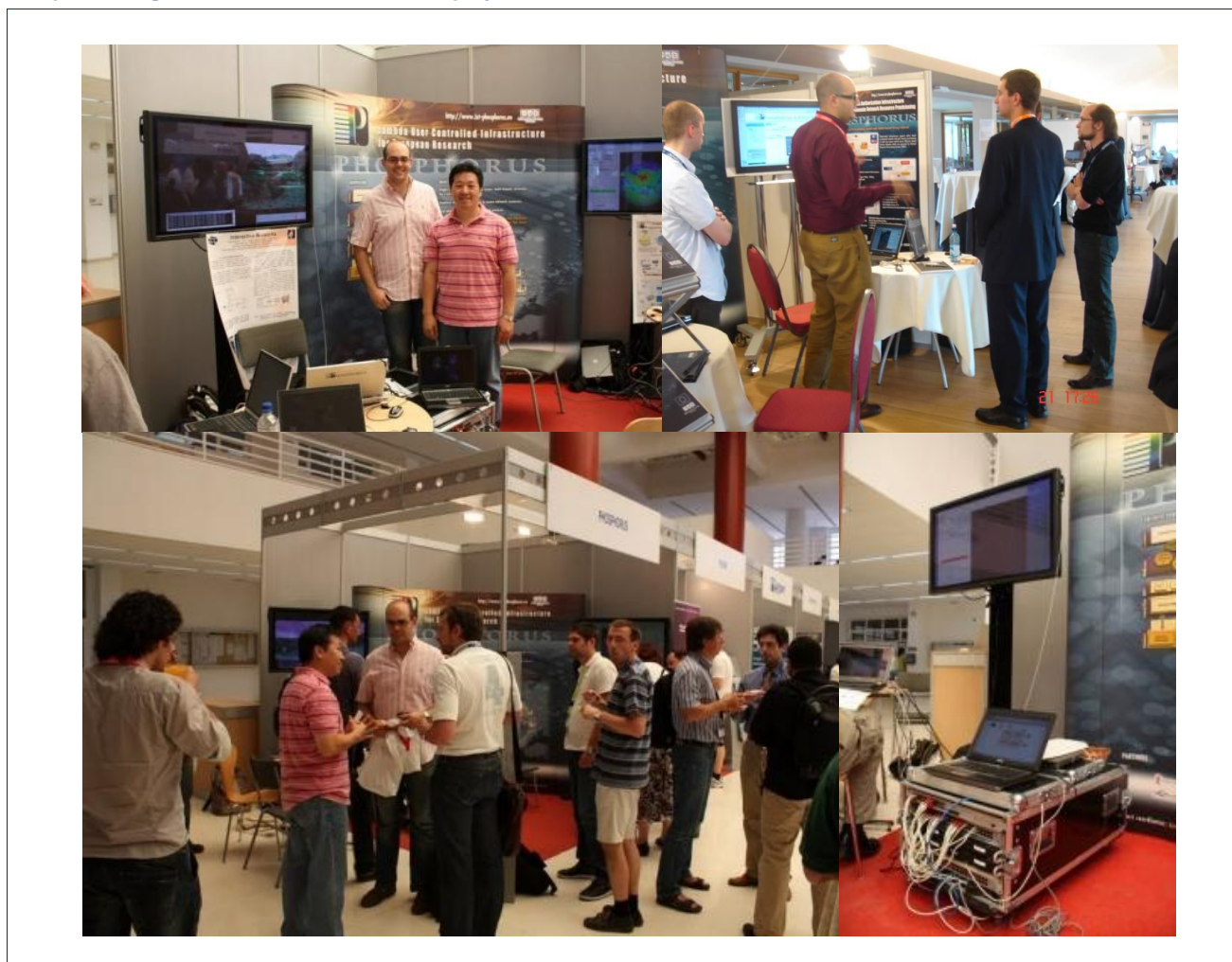
Figure 2-2: Developments on-demand demonstrations at the PHOSPHORUS booth (TNC 2009)

During these presentations, there were presented Phosphorus two Bandwidth on Demand systems: Harmony and G 2 MPLS Control Plane cooperating with Grid applications and Grid middleware not only for network resource provisioning but also for Grid resource co-allocation. Additionally there were presented AAA system for network provisioning systems. All these Phosphorus developments were targeted to interests EU and Non-EU NRENs. During TNC'09 demonstration, there were participating KISTI NREN from Korea which have installed Harmony system which was additionally interconnected with Phosphorus testbed (please see Figure 2-3 ).