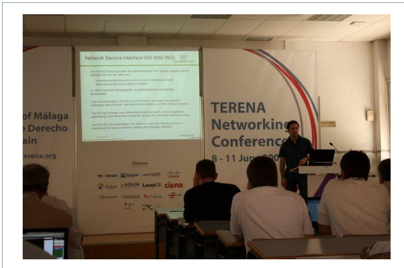
Figure 2-1: On-demand network services for Scientific Community workshop session (Málaga, Spain, EU).

simulators by the presentation of solutions for seamless single-step provisioning of on-demand services across multi-domain networks.