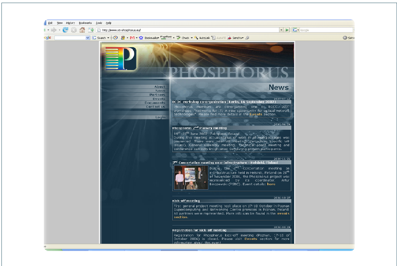
Figure 2.1: Homepage of the PHOSPHORUS website

A website was developed to act as a platform for public outputs such as publications, public deliverables, and public standardisation drafts. It is the main means for dissemination to the general public. The website presents a brief summary of the PHOSPHORUS project, all events that have taken place since the start of the project, a news section and a comprehensive contact details list of all partners involved in the project. The final structure of the website is detailed below along with a short description for each section and audience targeted.