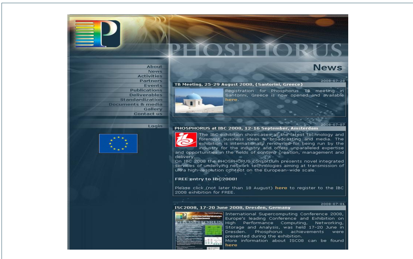
Figure 2.1: Screenshot of the PHOSPHORUS website

The website can be accessed through http://www.ist-phosphorus.eu