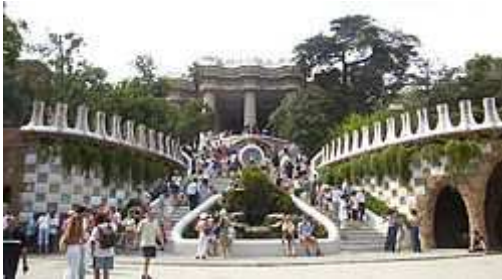
The entrance to Gaudi's "Park Güell"

Barcelona contains 68 municipal parks, divided into 12 historic parks, 5 thematic (botanical) parks, 45 urban parks and 6 forest parks. They range from vest-pocket parks to large recreation areas. The parks cover 10% of the city, growing about 10 ha (25 acres) per year.