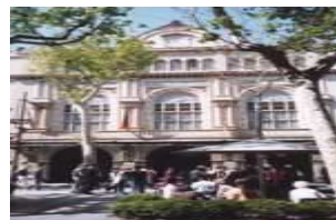
The façade of the Liceu, as viewed from La Rambla

Barcelona has many venues for live music and theatre, including the world-renowned Gran Teatre del Liceu opera theatre, the Teatre Nacional de Catalunya, the Teatre Lliure and the Palau de la Música Catalana concert hall.