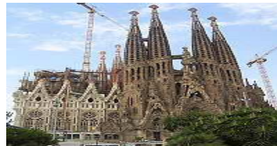
The Sagrada Família church, Gaudí's masterpiece,

church of the Sagrada Família, which has been under construction since 1882, and is still financed by private donations. As of 2007, completion is planned for 2026.